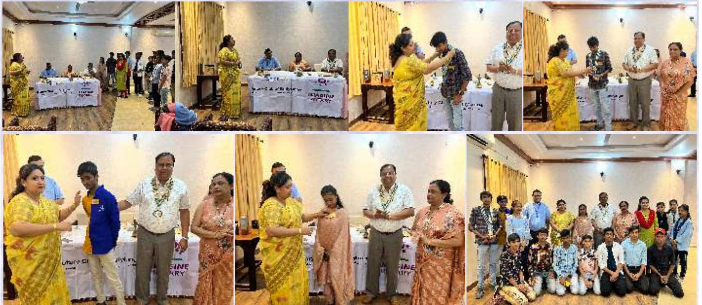
Reported by : Rtn. Nanda Ghosh

The children promised to bring leadership into action with the pledge of service above self by educating at least one person each. They promised to undertake projects to enhance basic education and literacy in their communities as every community has different needs and different opportunities to serve.